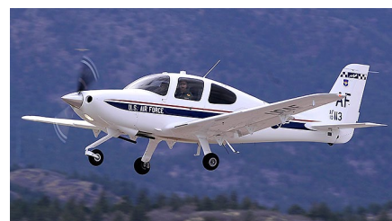
U.S. Air Force Academy Chapel (top). The T-53 represents the backbone of the Academy's Powered Flight training program in which over 600 cadets participate annually (bottom).